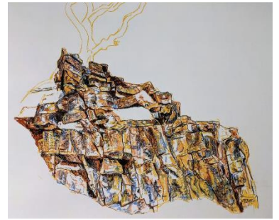
Staff example -Anglezarke Quarry

The drawing should take no more than 2 hours , but should be as ambitious as you can be. Materials are up to you. This is something that has been done by artists across time. See the artist examples shown as well as my own to get you started, please research other artists who might inspire you more. Of course you can do as many drawings as you like, but one is required, a more committed approach is appreciated though.