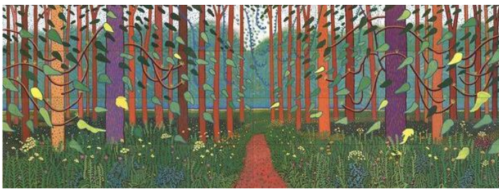
Hockney: Arrival of Spring;