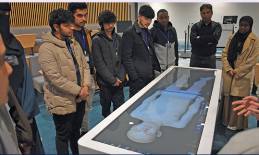
Medical School at Royal Bolton Hospital