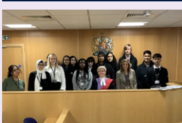
Bolton Coroners Court