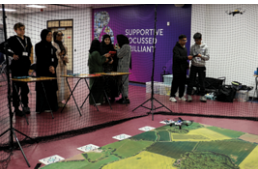
Drone Engineering Workshop