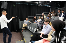
Actor and Broadcaster Tom Watt