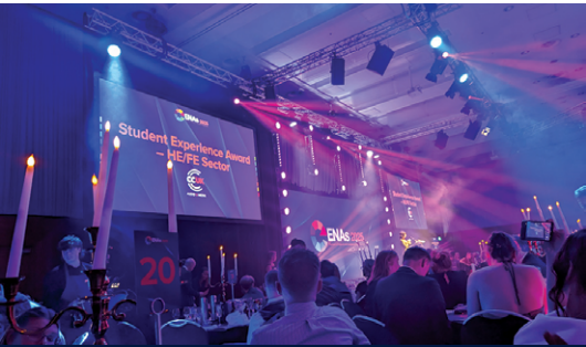
Educate North Awards 2025