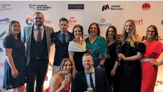
Staff from The Sixth Form Bolton