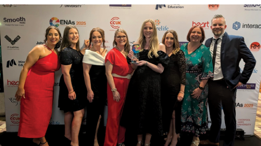
Staff from The Sixth Form Bolton celebrating

As well as winning the Student Experience Award, The Sixth Form Bolton were also finalists in two other categories at the awards: the Digital Teaching & Learning team in the Digital Education and Development Award and our Aspiring to STEM initiative in the Science, Technology, Engineering & Mathematics (STEM) Initiative Award.