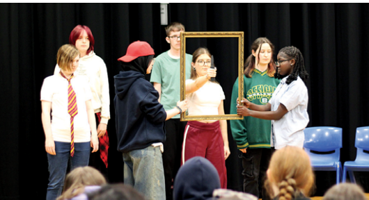
Performing Arts Go On Tour

Following a successful tour to schools across Bolton, where valuable feedback was gathered, the production is now entering its next phase of development. This summer, the enhanced performance will be filmed, with the final footage set to serve as a vital educational resource. Both organisations will use the material in schools to support their ongoing efforts to raise awareness about the serious risks and consequences of carrying knives. Well done to our amazing performing arts students!