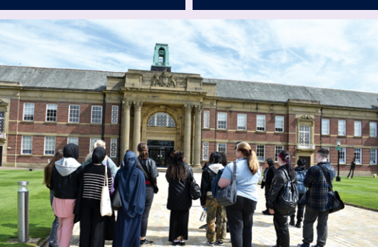
Edge Hill University