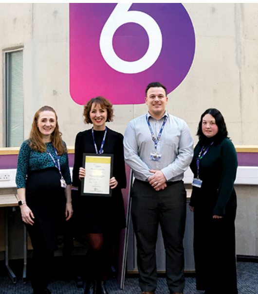
Award Winning Careers Team

Congratulations to our fabulous Careers Team!