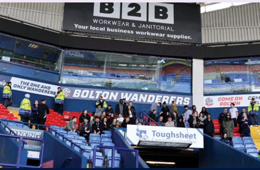
Major Incident Day at Bolton Wanderers

Whether you're building new skills on campus or heading out on inspiring trips and visits, there's always something to get involved in. These experiences are all about helping students discover new interests, aim higher, and explore the world beyond their everyday routine.