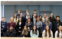
Greater Manchester Police