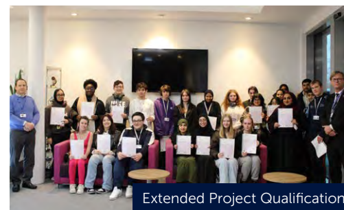
Extended Project Qualification

While completing this project you will increase your academic toolkit and develop those research skills which are so highly valued by universities. The EPQ can be particularly helpful to students wishing to pursue a career in Medicine, Dentistry or Veterinary Science. It will demonstrate that you are motivated, organised, imaginative and driven. The EPQ carries up to 28 additional UCAS points.