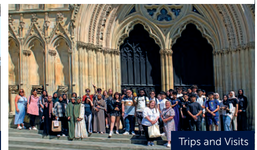
Trips and Visits