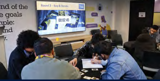
DiSH Workplace Safari

It has been an exciting term for enrichment at B6, with students taking part in a wide variety of trips designed to broaden their horizons and connect learning to the real world. Highlights have included conservation work at Chester Zoo, university visits to Cumbria, Edge Hill and the University of Greater Manchester, and two Workplace Safaris to DiSH and AECOM. Students also represented B6 at the Next Gen Entrepreneurs Competition at Lancaster University and took part in a Health Insights visit at the University of Cumbria. These experiences have given learners valuable insight into future careers, university life and the skills needed beyond the classroom.