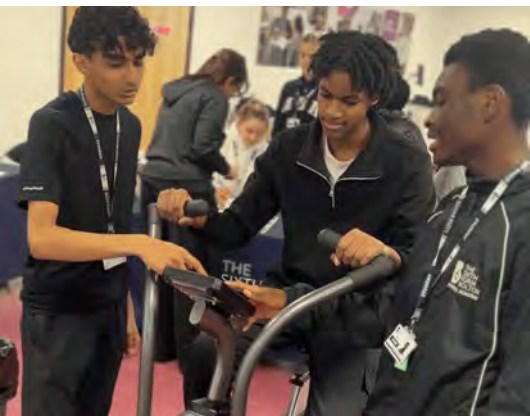
Active Travel Day

The event encouraged students to reflect on everyday journeys, highlighting how many can be completed on foot. Staff praised the students for creating an engaging and impactful experience, supporting healthy lifestyles, sustainability and community partnership.