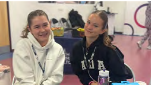
Active Travel Day