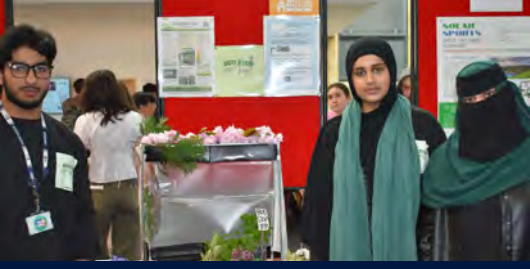
Next Gen Challenge at Lancaster