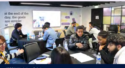
AECOM Workplace Safari