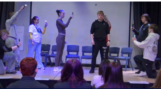
Performing Arts Go On Tour