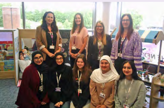
T Level Education & Early Years

We are incredibly proud of everything this pioneering group has achieved and look forward to seeing their continued success as they move into the next stage of their careers.