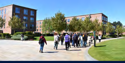
Teacher Day at Edge Hill