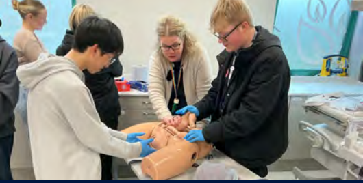
University of Cumbria