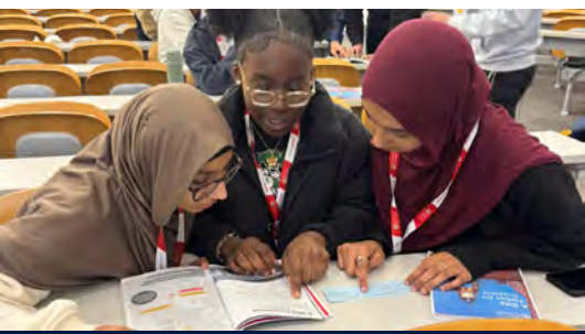
University of Chester trip