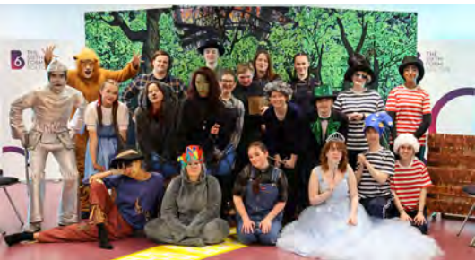
Wizard of Oz Cast

Year 2 students concluded their course with a final showcase celebrating their achievements. The term ended with a vibrant production of The Wizard of Oz , performed to sold out audiences over Easter. It has been a brilliant term, and we are incredibly proud of our students' hard work and creativity.