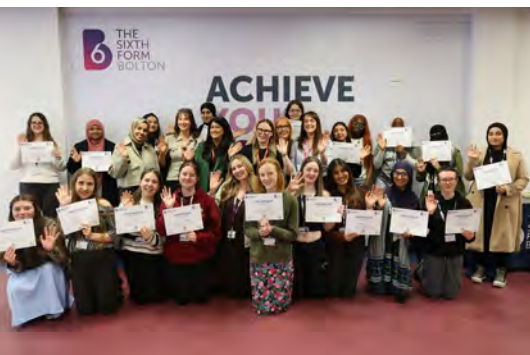
Women into Leadership Luncheon

Well done to all involved in our largest Student Leadership Programme to date.