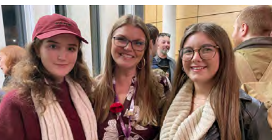
Film Premier – In The Kommandant's Garden

Life at B6 offers students plenty of opportunities to develop skills both on and off campus. Through a variety of trips and visits, students can broaden their horizons, raise their aspirations, and build their knowledge. A special mention to our Education and Early Years T Level Year Two group who enjoyed an insightful visit to Baby Basics in Bolton, where they met the dedicated volunteers who support families in the local community. Students learned about the vital services the charity provides, including supplying essential items to parents preparing for the arrival of their baby.