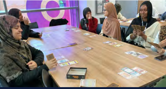
Sociology Board Game Battles