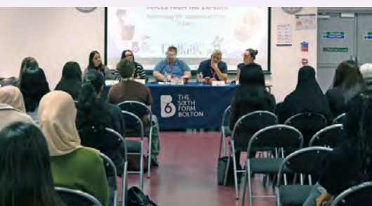
University of Greater Manchester Panel