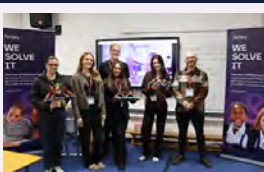
Amey Engineering Day