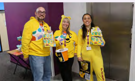
Children in Need 2026