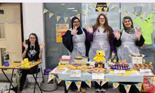
Children in Need 2026

As our students settle back into college life after the Winter break, we look forward to another hardworking and action-packed term ahead. I do hope you have enjoyed this snapshot of life at The Sixth Form Bolton. For more good news stories please follow us on social media.