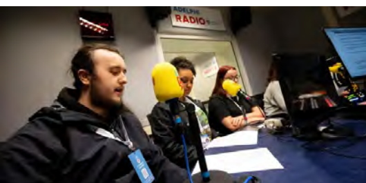
BBC Verify's National Tour