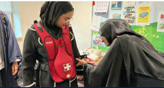
Pediatric First Aid