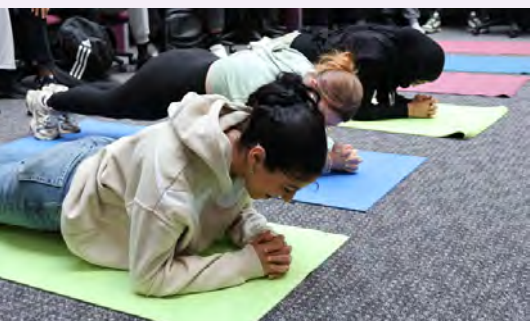
National Fitness Day