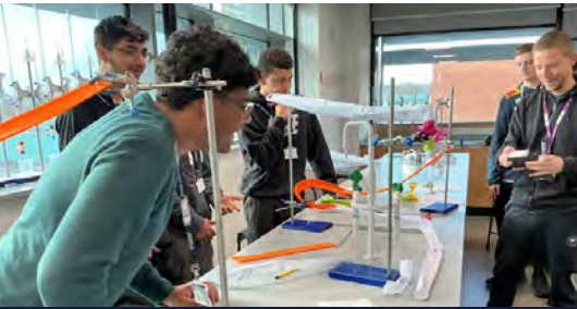
Marble Run Madness