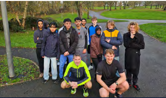
5k Park Run

Our first-year students enjoyed a full Enrichment Day away from their usual timetable, taking part in a wide range of engaging activities. Designed to develop new skills and enhance subject knowledge, enrichment helps students stand out in future university and job applications, while also providing opportunities to make new friends and have fun. The day included a mix of external trips and on-campus sessions, with a strong focus on fitness, mental health, and wellbeing.