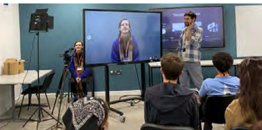
Arden UCEN School of Theatre Tour and Workshop